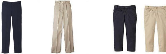
Uniform style flat or pleated pants and Capri pants. Solid colors only: Navy Blue, Khaki and Black