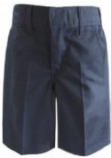
Boy's Uniform style shorts