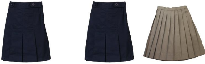
Uniform style pleated Chapel skirt (Must have pleats). Solid colors only: Navy Blue, Khaki and Black.