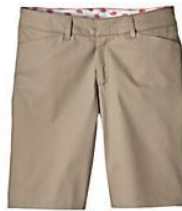
Girl's Uniform style shorts